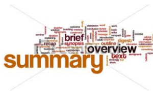
© Can Stock Photo - csp22943117